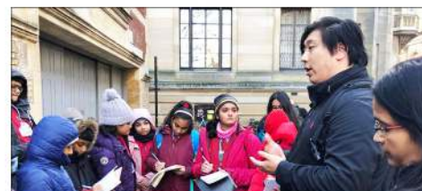
Oldest Debating Society in the World