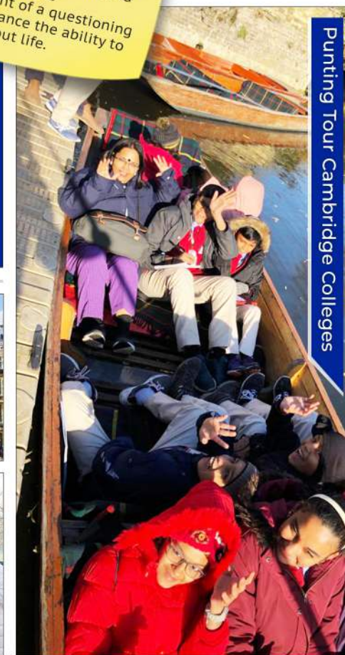
Punting Tour Cambridge Colleges